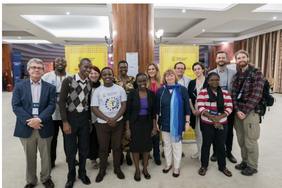
World Council of Churches communication team staff and stewards at the Conference on World Mission and Evangelism in Arusha, Tanzania, 2018